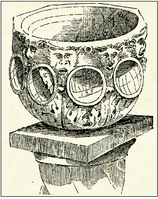
TABLE OF DATED SUNDIALS ARRANGED ACCORDING TO THEIR DATES.

III. DIALS OF EXCEPTIONAL DESIGN. IV. MODERN DIALS.