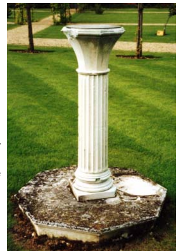
The stolen dialplate & its pedestal