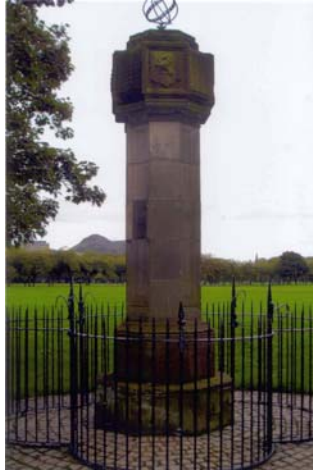
SRN 1306—The Meadows, Edinburgh

We would not expect to come across a dial mounted so high that it cannot be read without a stepladder, but several are