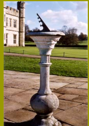
SRN 0406—Leeds Castle