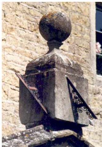
SRN 0023—The declining three face cube dial at Bourton-on-the-Water

detail and, as with the recent move to record more details of horizontal dials, maybe we should pay some similar attention to the recording of cube and prism dials?