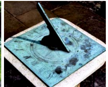
SRN 1086—Westminster College, Cambridge

There has been a Manor at Latimer since 1194 but Latimer House (now Latimer Place) gets its name from Edward III's gift of it to William Latimer in 1331. Later bought by William, Lord Cavendish of Hardwick, it is his Coat of Arms that decorates the building today and which heads this Newsletter. Permission to use the Arms is gratefully acknowledged.