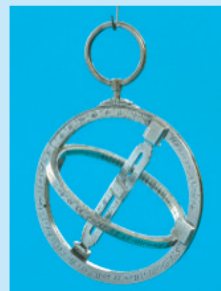
A Universal Equinoctial Ring Dial in silver by Henry Wynne, made around 1690.