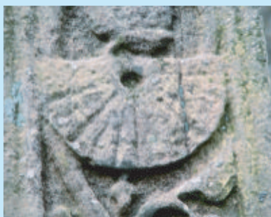
Saxon Sundial at Bewcastle Cross, Cumbria. It is the oldest surviving English sundial.

Website: www.sundialsoc.org.uk Quarterly high-quality colour Bulletin and Newsletter.