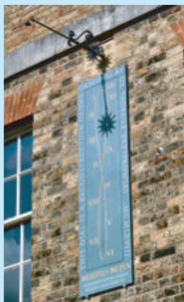
A Noon Mark sundial at The Old Royal Observatory, Greenwich, erected in 2012. Designed and created by BSS members. The shadow of the sunburst nodus crosses the figure 8-shaped analemma curve at noon GMT each day.

To advance the education of the public in the science and art of gnomonics.