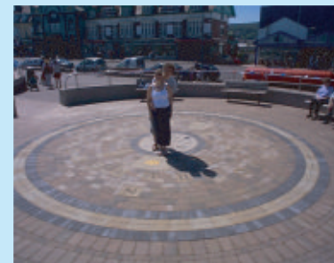
Human (Analemmatic) sundial in Somerset. Sundials of this type are popular in schools and public spaces because of their human involvement, large size and low risk

Autumn: A one-day meeting in Newbury. All gatherings are great opportunities to see dials, learn from one another and form great friendships. Novices and experts are equally welcome at all meetings.